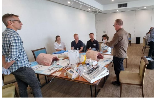
Participants undertaking skills training in chest drain insertion.

The 15th Annual Emergency Medicine Trainee Conference was held on Friday 7 October 2022 at Noah’s on the Beach in Newcastle. The Conference was hosted by Network 4 of the Emergency Medicine Network Training Program and was made up of a series of skills station workshops and interactive sessions led by 18 subject matter experts.