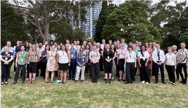
72 clinical and non-clinical NSW Health Pathology employees, participated in the NSW Health Leadership Program. HETI joins NSW Health Pathology in celebrating the achievements of all involved in the Program.