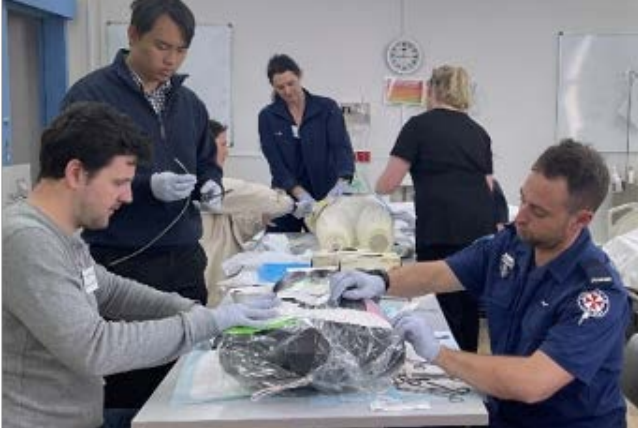
15 participants immersed themselves in a series of skill stations and simulation activities.

The HETI Centre for Rural Simulation took our flagship education program, the Emergency Masterclass, to Deniliquin this month.