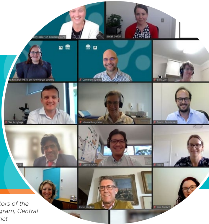
Participants and facilitators of the Medical Leadership Program, Central Coast Local Health District