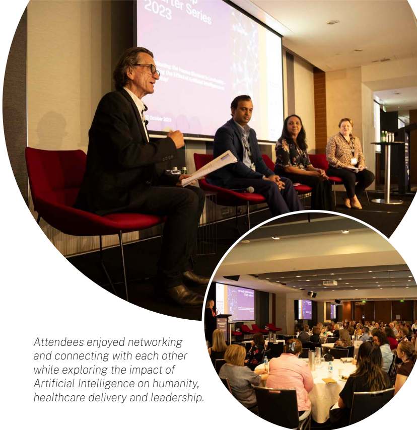
Attendees enjoyed networking and connecting with each other while exploring the impact of Artificial Intelligence on humanity, healthcare delivery and leadership.