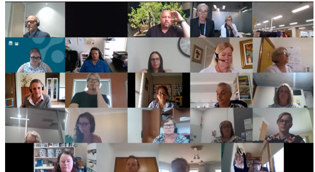
Workshop 7 - Theme: Concluding and Futuring. Program participants and faculty (HETI and MLHD), December 2020

"increased authorising environment to challenge respectfully"