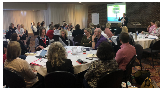
Workshop 2 - Theme: Achieving Outcomes, Griffith, NSW, November 2019

The first cohort of the multidisciplinary Marrambidya Leadership Program recently graduated, moving the program into its sustainability phase (the program launch was highlighted in the January 2020 edition).