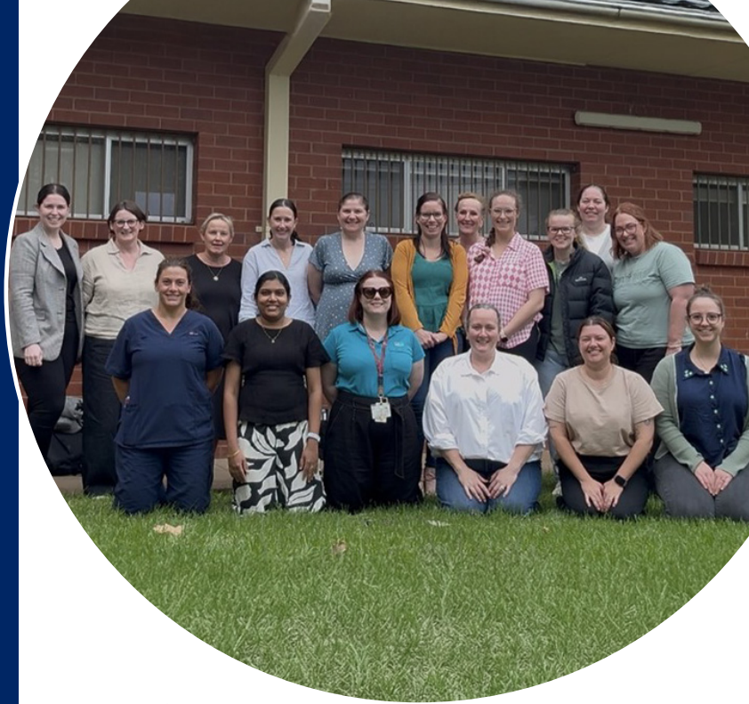
Leeton Simulation Fundamentals Participants